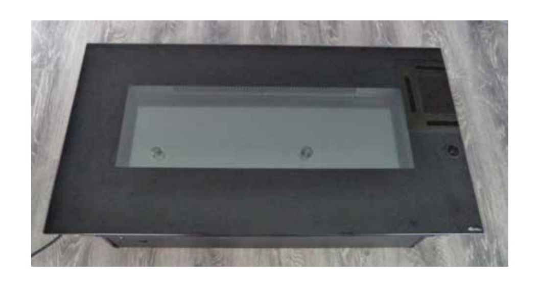
1. Carefully remove the front glass surround. Unscrew two screws at both sides to remove the surround.